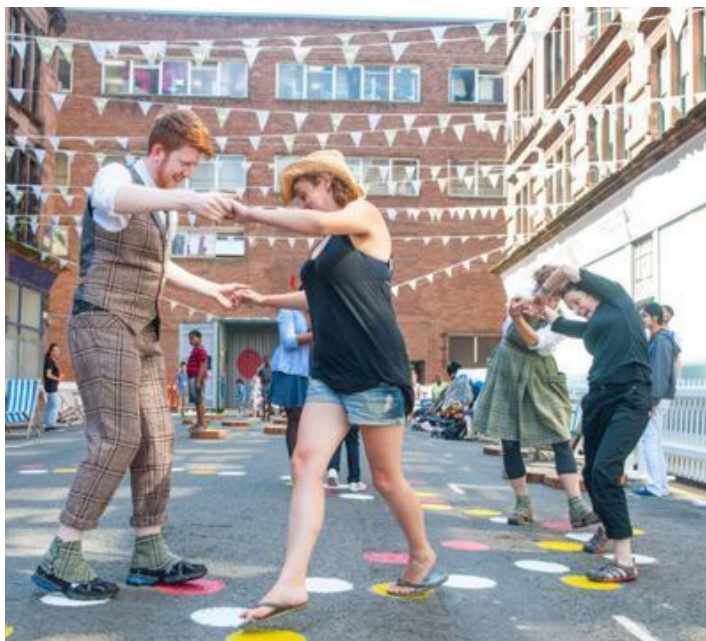
FLEXIBLE STREET ACTIVATORS AND MARKETS