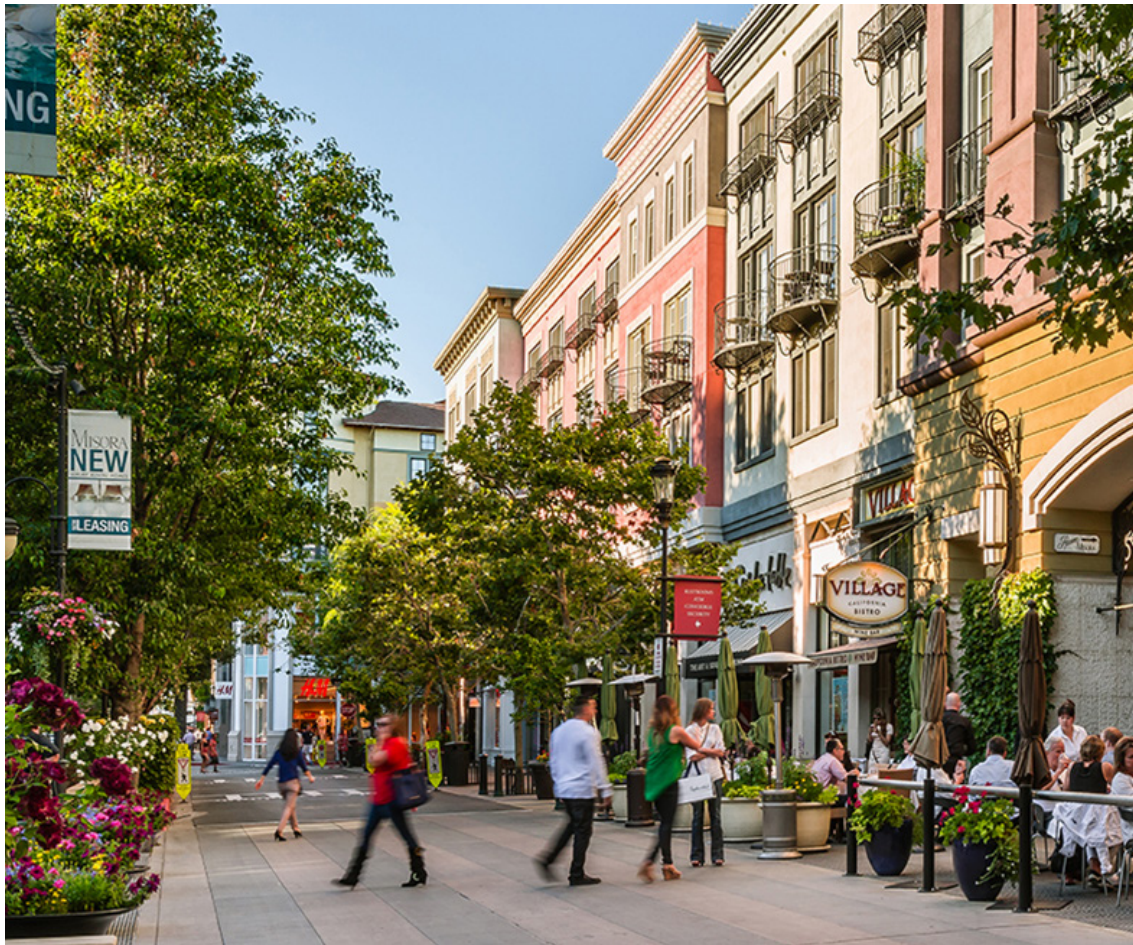
FLUSH CURB PEDESTRIANIZED STREET