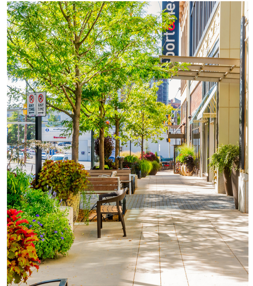
WEST SIDE OF 4TH STREET ALONG RETAIL