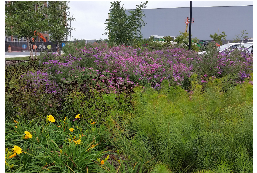
BIORETENTION PLANTINGS AND BRIDGE CROSSINGS