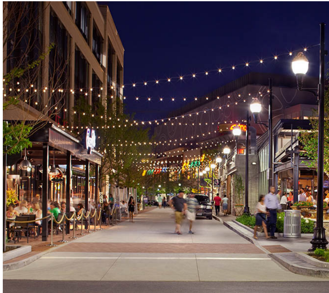
LIGHT POLES WITH DECORATIVE STRING LIGHTING OVERHEAD